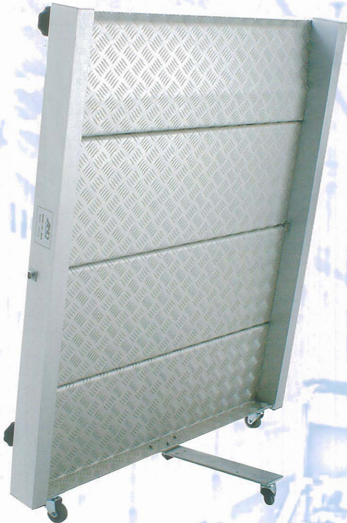
Castor Design for transport